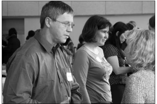
Food Matters! Forum creates opportunities to meet others working in the food system.

Membership in the Community Council is an indicator of support for the mission and work of the organization. Membership is open to any person or organization. In 2008-09 there were 108 members: 81 individuals, 41 social service agencies, 8 businesses and 2 government agencies. Members support the organization through their donations.